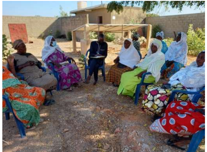
Focus group discussion group at Mbaling processing site.

In 2020, BD4FS undertook a Food Safety Situational Analysis (FSSA) of the artisanal seafood sector in Senegal and confirmed that traditional smoking of fish remains a common practice (Food Enterprise Solutions [FES], 2020). BD4FS also completed a desk review of the health risks associated with consuming smoked products, the different types of fish smokers and the levels of PAHs produced by each smoker, as well as costs and financing options for adopting modern smokers that produce lower PAH levels (FES, 2021). Based on findings from the literature review (FES, 2020), focus group discussions (FGDs) were held with women's associations of artisanal fish processors in Senegal to better understand their knowledge of PAHs, and to identify gaps and barriers within the food system that need to be overcome in order to improve the health and wellbeing of processors and consumers. FGDs were held at processing sites within the greater Dakar region and in the Petite Côte area south of Dakar in early spring of 2021.