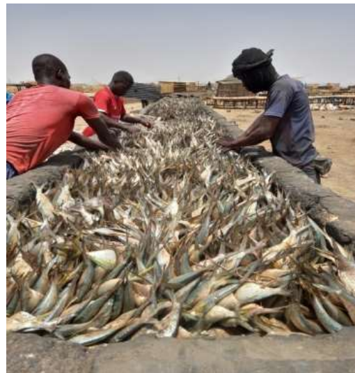
Men packing the fish braiser with fish, positioned heads down, to produce kéthiakh.

Women described two ways of processing the salted kéthiakh variety. The main variable determining the processing technique is accessibility to an oven or fish braiser. When women do not have access to an oven or fish braiser, the fish are spread on the ground, covered with fuel and braised with an intense fire for thirty minutes to an hour. After cooling, the fish are removed, beheaded, trimmed, and salted in basins for one half day. After salting, the fish are spread on racks for two to four additional days to dry. When a processor has access to an oven, the fish are stowed head down on oven grates and covered with galvanized iron sheets. The oven is then filled with straw or other fuel by men who are employed by the women to do the difficult tasks. The fish are braised with very intense fire for 30 minutes to an hour. After cooling, the fish are removed, beheaded, trimmed, and salted in basins for one half day, exactly as in the previous case. After salting, the fish are spread on racks for drying.