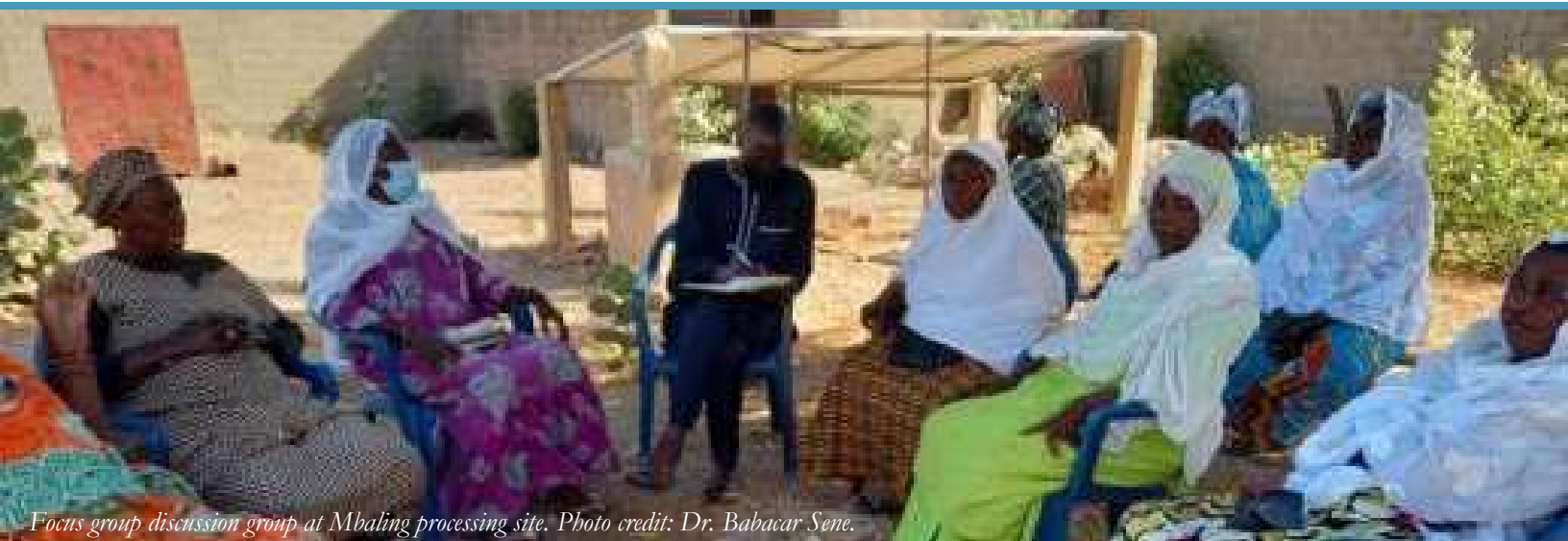
Focus group discussion group at Mbaling processing site.