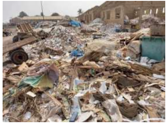
Waste products, mostly different types of paper and cardboard that end up being used as fuel at the Rufisque site.

The type and quantity of fuel used contribute to the synthesis of PAHs, and research has shown a positive correlation between PAH and lignin content (FES, 2020). Because of this, BD4FS was interested in evaluating the type of fuel used for processing. The FGDs revealed that various fuels are used throughout Senegal for braising and smoking, including baobab trunk, sawdust, straw, wastepaper, and cardboard. These findings are concerning as wastepaper is often contaminated with dyes and inks that can contain heavy metals like cadmium and lead. The intake or somatic absorption of these heavy metals has been linked to a variety of health problems including birth defects, kidney and liver failure, and interference with red blood cell production (Zender Environmental for Institute of Tribal Environmental Professionals & Central Council Tlingit Haida Tribes of Alaska Solid Waste Alaska Network, 2005). Therefore, in addition to PAHs, the presence of heavy metals in the smoke and in the final processed fish products constitutes a potentially high health hazard to both processors and consumers.